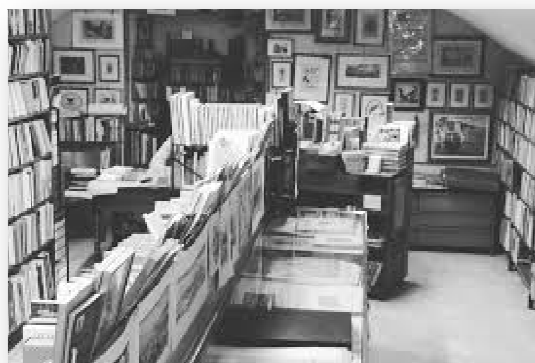
TRADITIONAL FLORENTINE BOOKSTORE "GIORNI"

It's important to pass on their traditions and preserve them in time